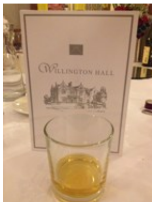
The "true spirit" of the evening!