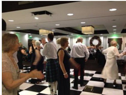
A Dashing White Eightsome Reel, or something like that!