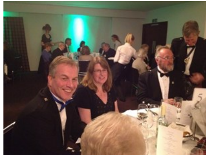
Good food and conversation abound while the ghost of St. Andrew himself tries to make an appearance at the back.