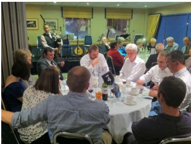
If we ignore Fraser perhaps he will stop piping