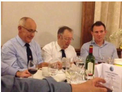
Senior officials of the Association note down voters' names in their little black books.