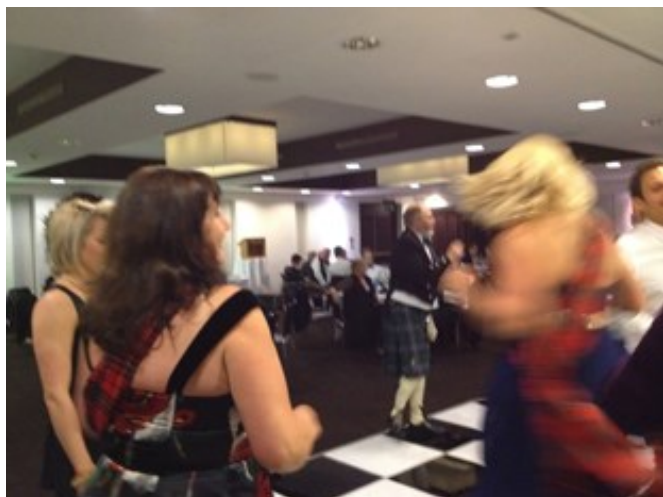
That's more like it. Great action shot as Wonderwoman girls in.