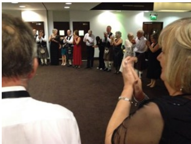
Everyone joins in for the traditional Auld Lang Syne at 1.00 a.m. before finally collapsing.