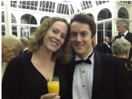
This isn't just orange juice you know!