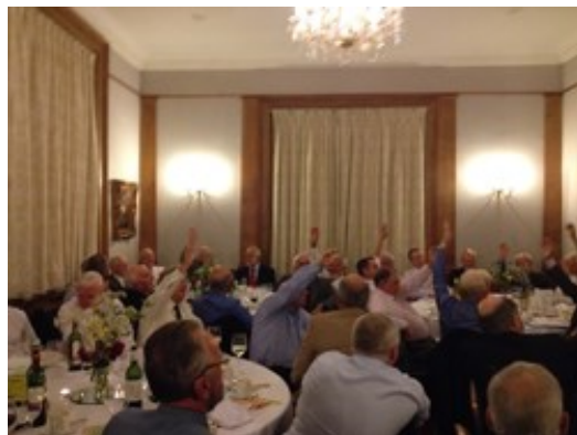
The vote. Does someone at the back have both hands up?