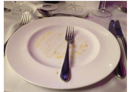
Obviously, didn't like the haggis much!