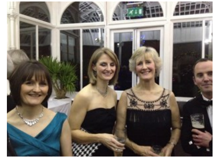
A bevy of lovely ladies enjoy a wee bevvy before dinner