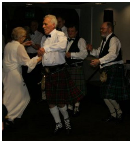
These must be professionals. Look at the tilt of the kilt!