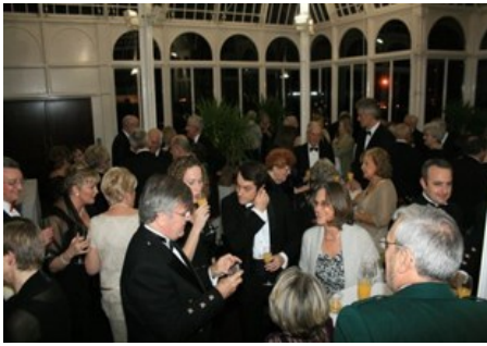
The expectant crowd gathers for an evening of eating, drinking and jigging.